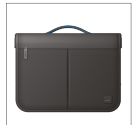
37304 Travel bag 37305 Travel bag for Her