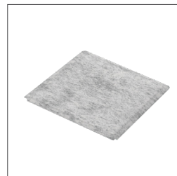
Filters – standard 36850 (1 pk) 36851 (2 pk) 36852 (12 pk) 36853 (50 pk) Filters – hypoallergenic 36855 (1 pk) 36856 (2 pk) 36857 (12 pk) 36858 (50 pk) Filter cover 19768 Gray (AutoSet for Her, AirCurve) 19729 Charcoal (CPAP, Elite, AutoSet)