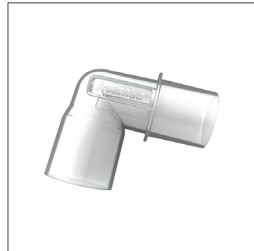
37394 Air10 tubing elbow (in-line elbow for use with non-heated tubing)