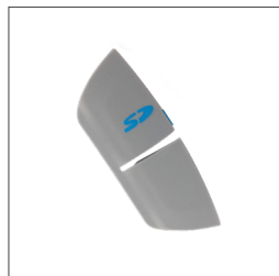
Side panel rubber SD card door 19766 Gray (AutoSet for Her, AirCurve) 19728 Charcoal (CPAP, Elite, AutoSet)