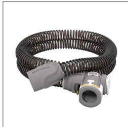
37296 ClimateLineAir heated tube 37357 ClimateLineAir Oxy heated tube 36810 SlimLine™ tube