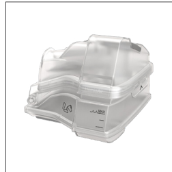
HumidAir heated humidifier 37299 Standard tub 37479 Cleanable Tub