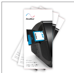
SD card protective folder 37329 with card (10 pk) 37330 without card (10 pk) 36931 SD card reader