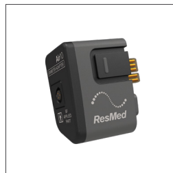
37302 Air10 oximetry module 22374 Xpod® oximeter 22371 Xpod clip 707560 Reusable soft sensor (medium) – 3-meter cable 370004 Air10 Oximetry Complete Kit: Includes oximetry module, Xpod, Xpod clip, reusable soft sensor (medium)