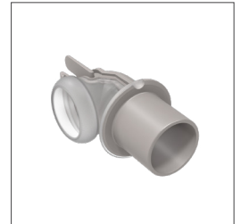
37310 Air outlet (connects device and tube; disinfect or replace for multi-patient use)