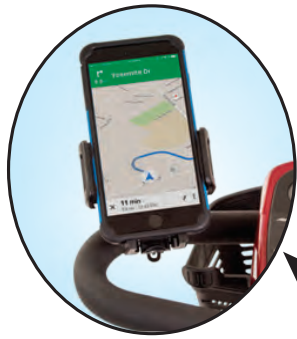
Cell Phone Holder