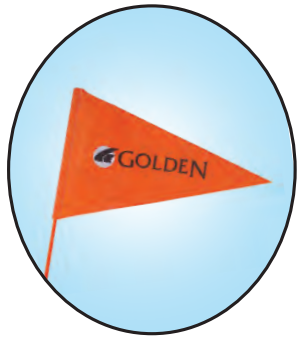
Safety Flag (Included in Every Model!)