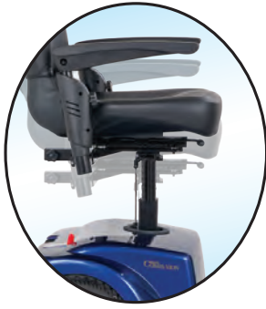
Power Elevating Seat*