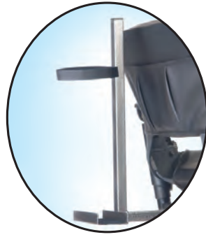
Quad Cane Holder