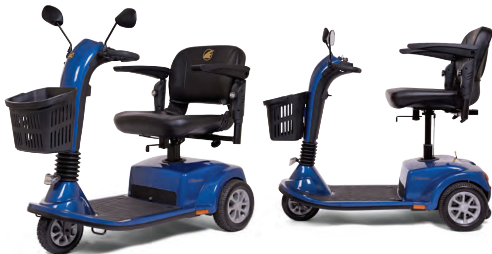
Companion GC340 Shown with optional power lift seat.

The Golden Companion scooters are your ticket to ride first class every day! Allow the luxurious, full-size Companions to enhance your life and take you to the places you've always had trouble getting to. Shop in the mall, attend sporting events and enjoy the great outdoors with the unmatched comfort of your favorite new Companion! All Companion models feature: