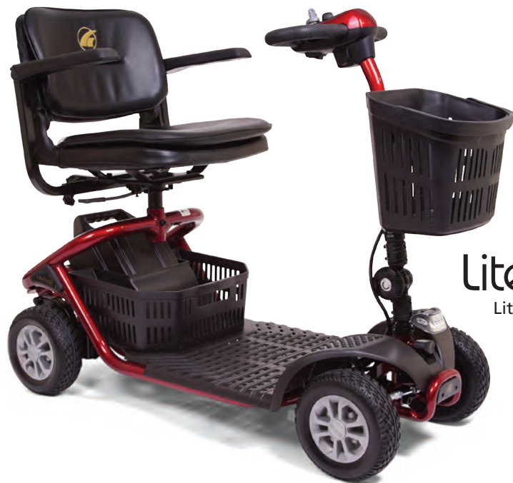
LiteRider GOLDEN LiteRider GL141D