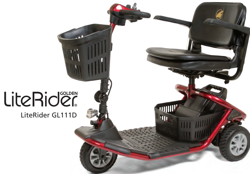
LiteRider GOLDEN LiteRider GL111D

The unique tubular design of the LiteRider scooters gets you wherever you need to go in a style all their own. The only scooters to come with two cargo baskets standard, the LiteRiders are easy to disassemble, and maneuver smoothly indoors and out.