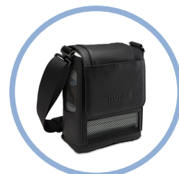
Inogen One G5 Carry Bag* Item #CA-500