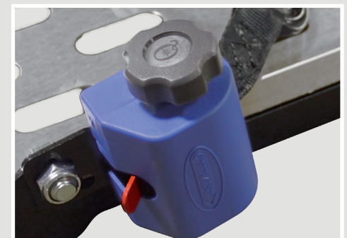
Q'Straint Retractable Hooks