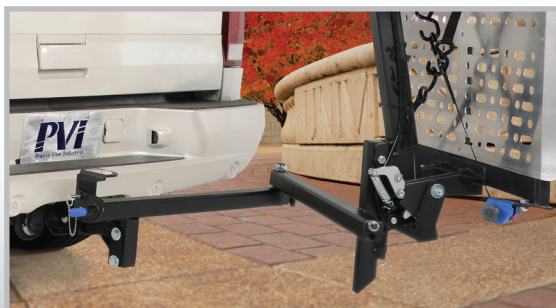
Swing-Away - AL105