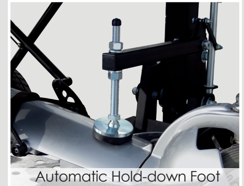
Automatic Hold-down Foot