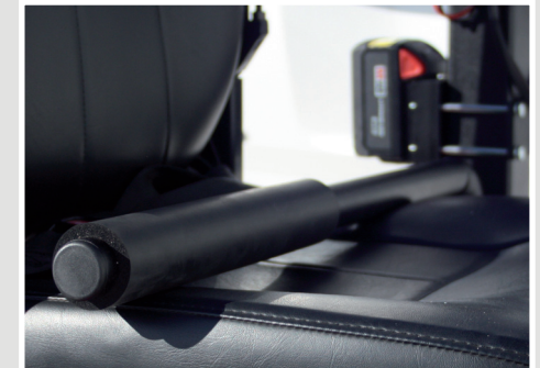
Automatic Hold-down Arm