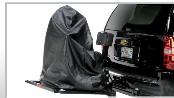
Wheelchair and Scooter Covers