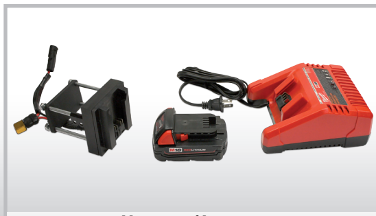
Battery Kit - ALBAT